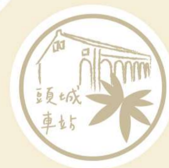
Toucheng Railway Station