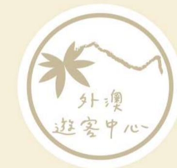
Waiao Visitor Center