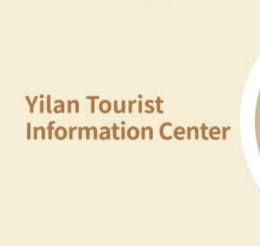
Yilan Tourist Information Center