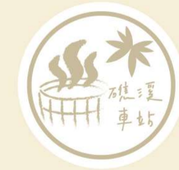
Jiaoxi Railway Station